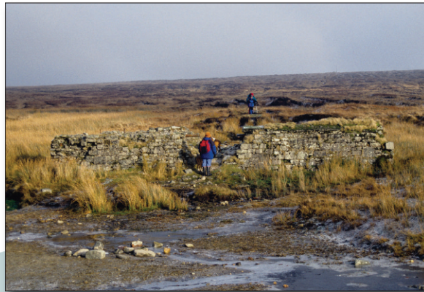
Remains of Rattlebrook Peat Works.