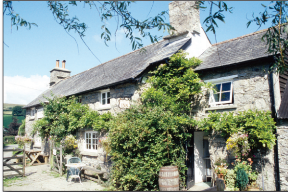
The Rugglestone Inn Widecombe-in-the-Moor.