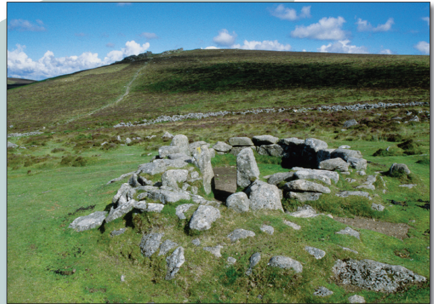
Hut circles in Grimspound.